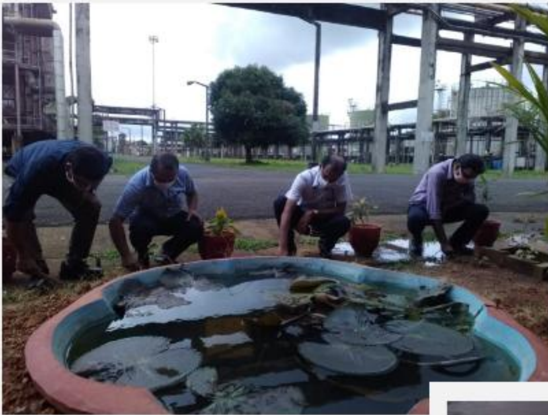
The front area of the main control room was developed by production team by planting flowering plants and beautifying the area