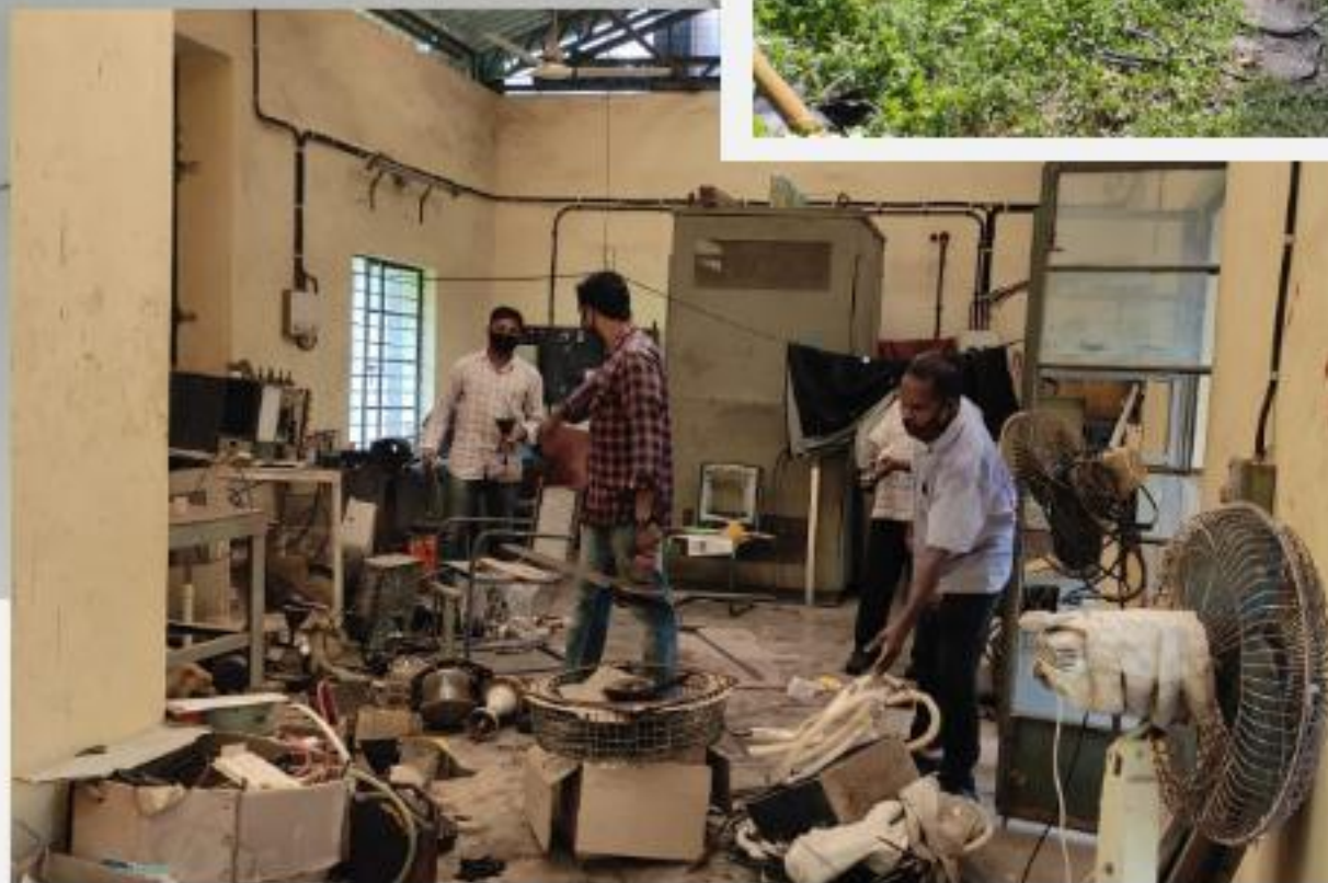
Employees cleaning the electrical utility substation room as part of swachhta pakhwada